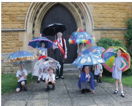
Upton Primary School Rising Stars